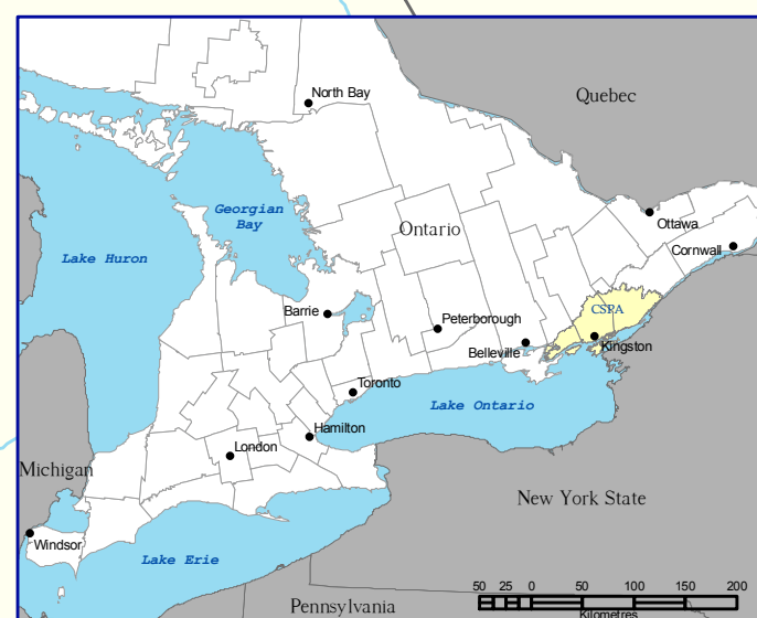
Areas where drinking water threats that result from conditions can be identified and ranked through Technical Rule 126: